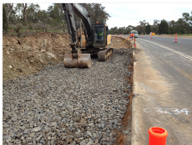
Road Widening at Bethungra Hill

The remainder of the project will see the replacement of one other culvert, a reconstruction of the existing pavement to improve ride quality and the installation of wire rope safety barriers to replace and extend the length of road currently protected by steel guard rail.