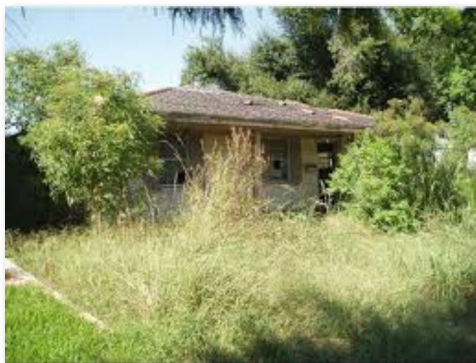
Long grass is a problem in warmer months

The coming summer months are going to be dangerous times for bushfires, vermin and snakes. Please make sure you act now to rid your property of long grass.