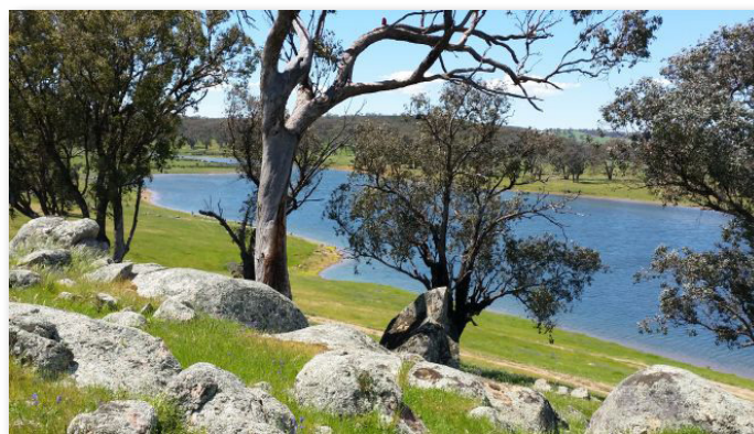
Bethungra Dam wall is to be retained at the same height

This is a positive outcome for the village of Bethungra and the wider communities of Junee Shire and Cootamundra Shire who frequent the dam throughout the year. The State Government should be commended for their perseverance reducing the risk category of the dam which has been of concern to the community for over 10 years.