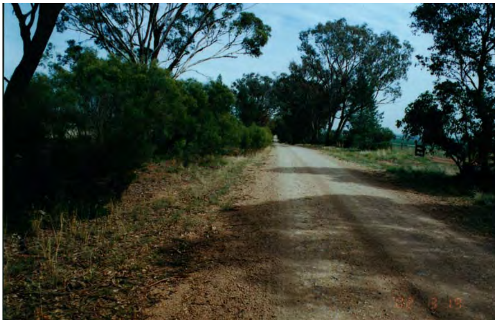
Macaulays Lane – an example of a medium conservation value roadside