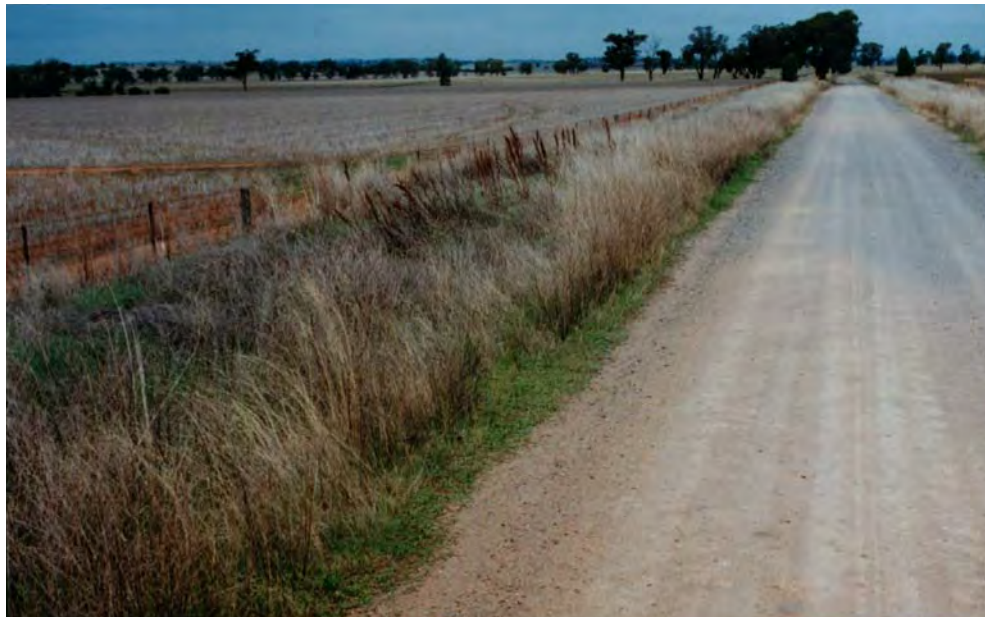
Wyoming Lane – an example of a low conservation value roadside