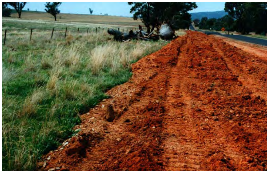
Road maintenance on Dirnaseer Road has caused extensive damage to native perennial grasses