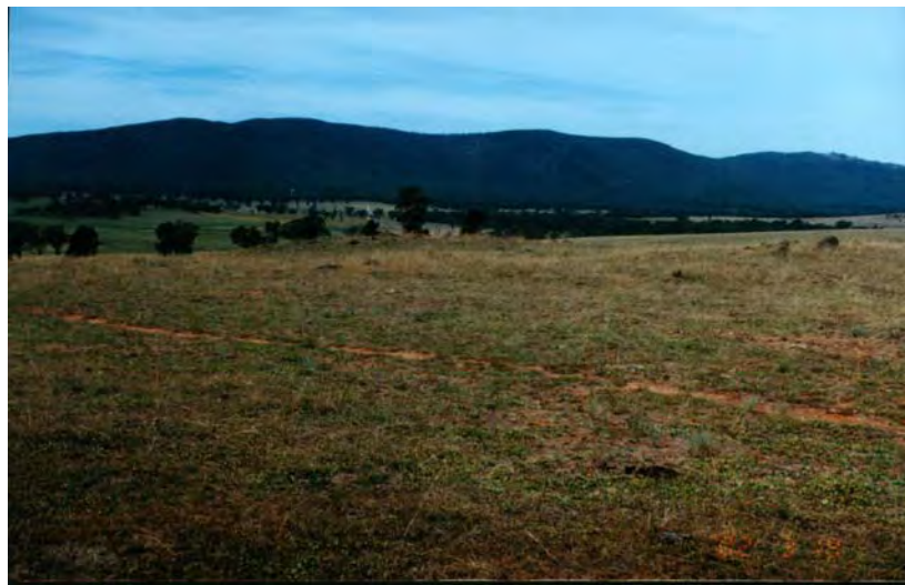
Bethungra Hills from Ironbong Road

Following a public tender process Greening Australia NSW was engaged to conduct the vegetation survey in August 2001.