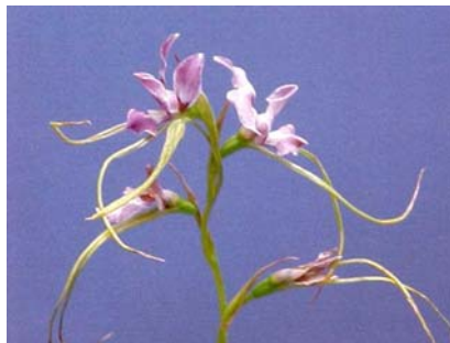
Purple doubletail orchid, Waterworks Road.

It is possible that other native plants present in the Shire have not been identified during the survey, either due to their ephemeral nature or the limitations of the survey method.