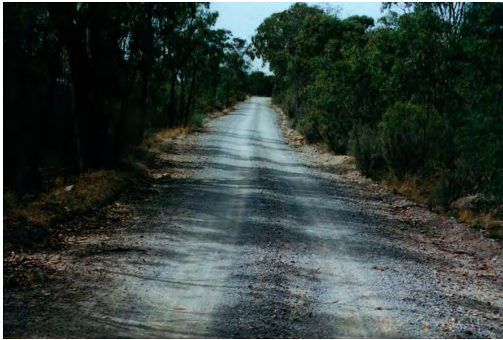
Bethungra Waterworks Road – an example of a high conservation value roadside