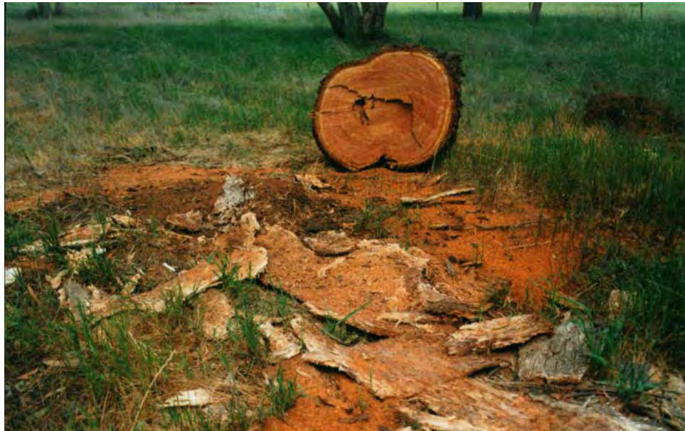
Marinna Road – firewood removal was identified on many roadsides in Junee Shire. This practice destroys vital habitat of native birds and animals.