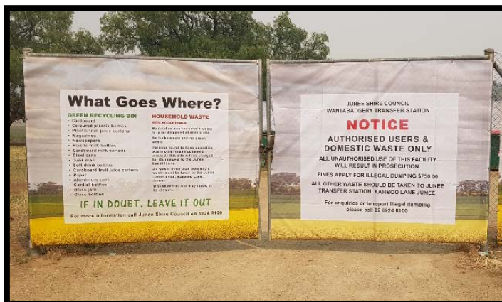
Wantabadgery Transfer Station wrap and signage.