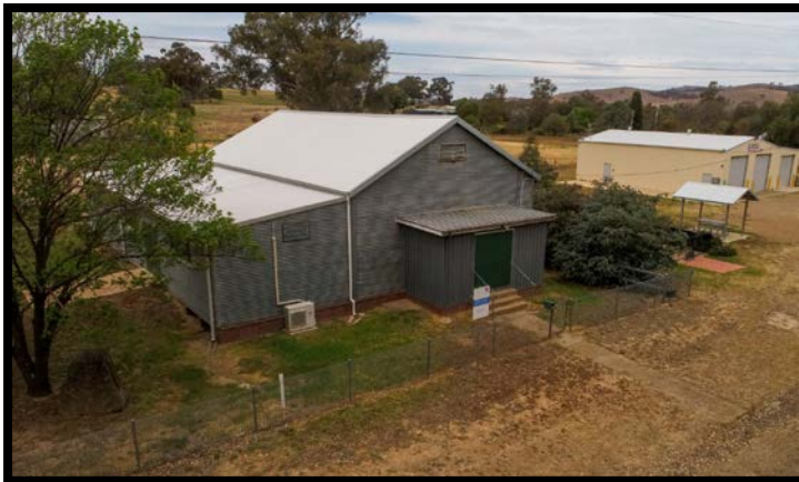
Wantabadgery McDonald Memorial Hall.