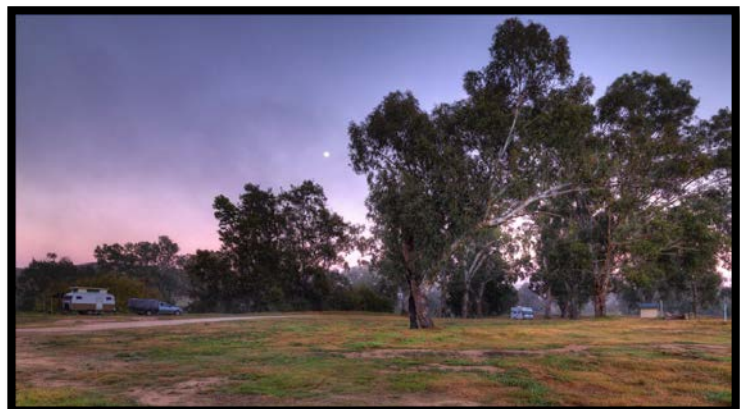
Sandy Beach Reserve.