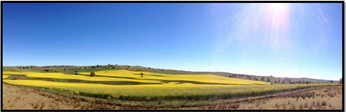
Wantabadgery agricultural land.

The land and surrounding areas are of great importance for those within and around Wantabadgery, especially as it relates to agriculture and tourism. Many residents rely on the agriculture industry for their livelihood, furthering their appreciation for their location and the affordability of property within and surrounding Wantabadgery. The community requests regular and continual road maintenance to sustain safety in their environment, ensuring trees are not too close to the road, weed infestation along road edges kept under control and roads and intersections are safe. Concerns were raised regarding road flooding which can occur in extreme weather events. Drainage considerations was a focus within the community meeting.