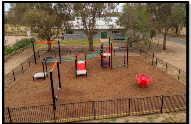
Community playground located at the Wantabadgery McDonald Memorial Hall.