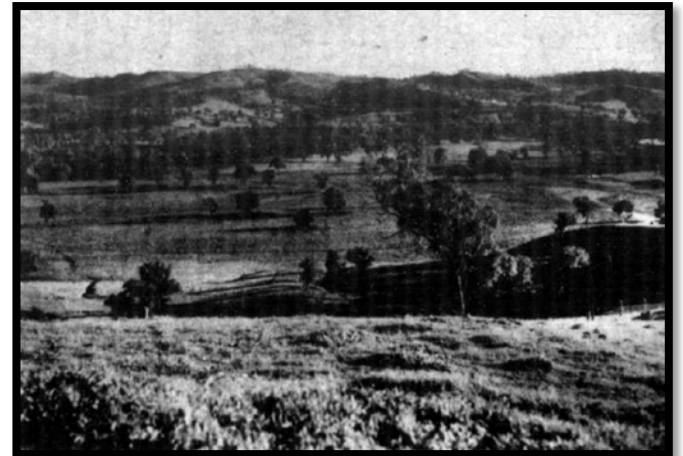
Typical Wantabadgery country.