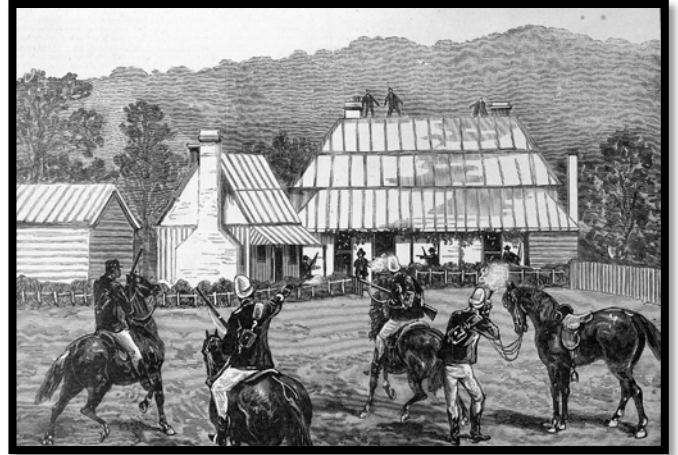
Arrival of Wagga Police at Wantabadgery Station.