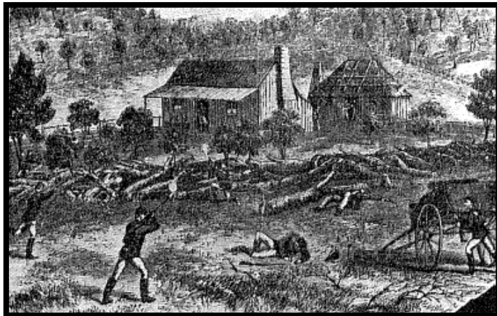
The final encounter with the bushranger at McGlade's Hut.