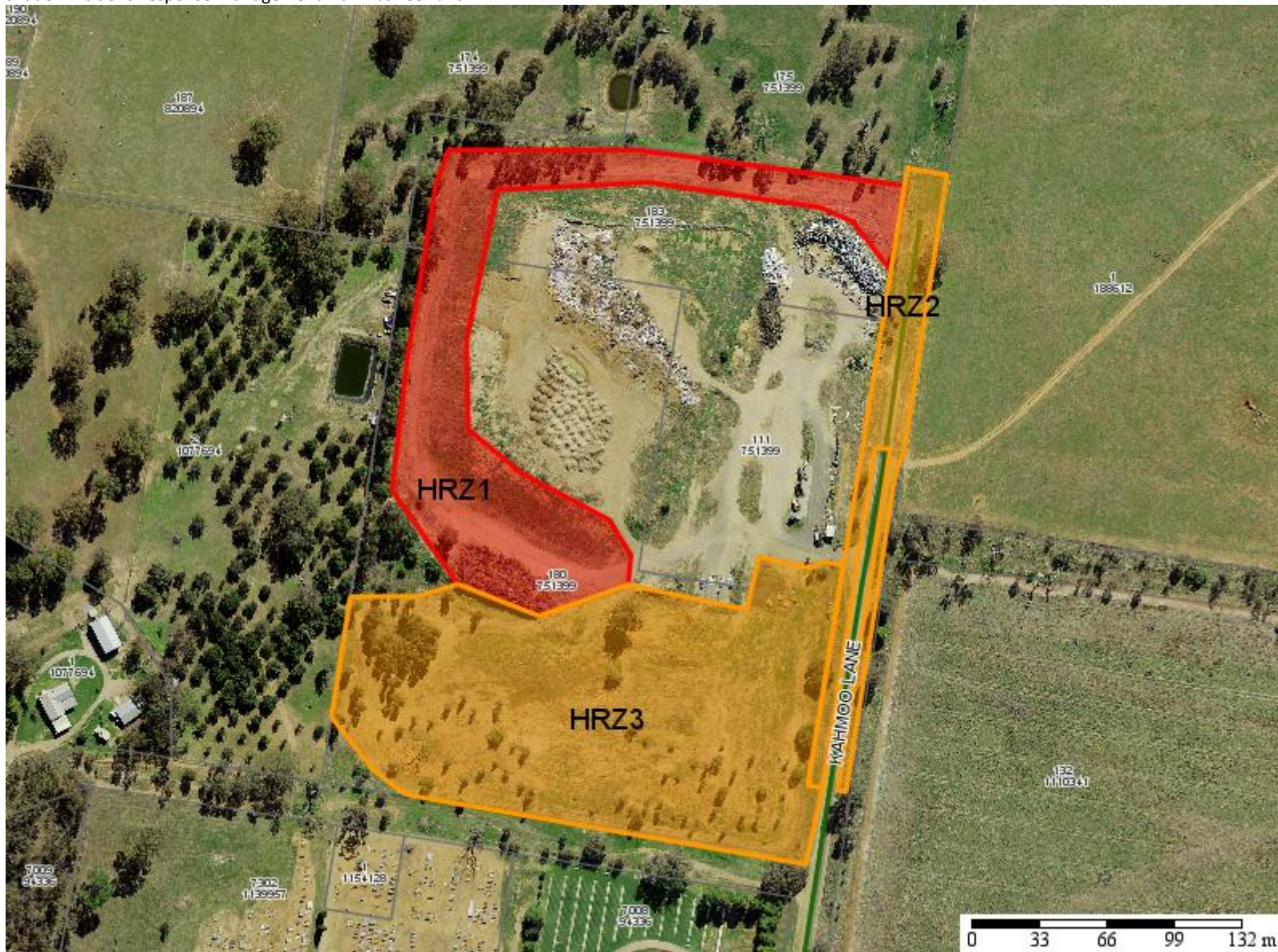
Figure 2 Junee Landfill Hazard Reduction Zones Map